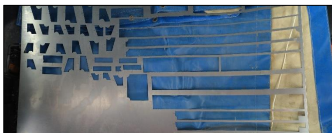
Skeleton of metal sheet after parts have been cut out using SolidWorks drawings.

These files have saved many hundreds of hours as all parts are now being cut out at the one stop cut shop in Silverdale ( http://www.onestopcuttingshop.co.nz )