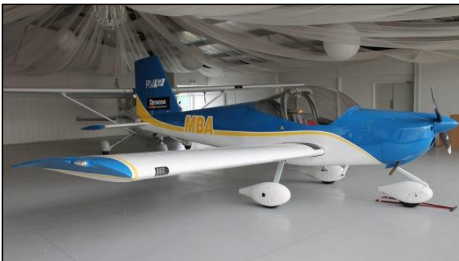
What the finished Vans RV 12 two seater kit will look like.

From working on wiring, flaperons, exhaust and wheel fairings to learning the complex imperial system by the beginning of 2016, a second Mercury Bay Area School built plane will be ready for take-off.